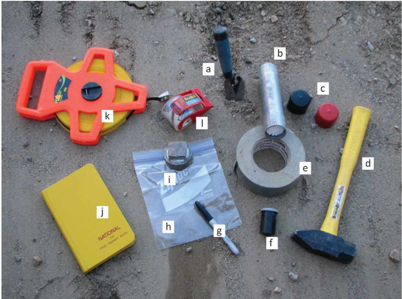
FIGURE 3. Typical sample-collection gear used for luminescence dating. Items identified include: (a) trowel (or field knife or small shovel) for clearing back of sediments from the face of the trench or outcrop and collection of sediment for dose-rate samples; (b) OSL sampling tube (metal or other opaque material) sharpened at one end and pre-loaded with a styrofoam plug on the sharpened end to limit sediment shaking during pounding; (c) end caps for sample tube (tin foil and duct tape can be substituted if not available); (d) sledge hammer for pounding in sample tube (rubber mallets and light field hammers are not recommended for most sediment types); (e) duct tape to seal ends of tubes; (f) film canister for water-content samples (triple-bagged zip-bags or other airtight containers also acceptable); (g) permanent marker for labeling samples; (h) one-quart (ca. 1 liter) zip-seal bag half-filled for dose-rate sample collection; (i) pounding cap (a 2-in outside threaded plug is shown; it is important not to use pounding caps that fit tightly on tubes or that have internal threads as they can get permanently seized onto pipes); (j) field note book to document stratigraphic context and GPS location and elevation; (k) measuring tape to determine sample depth; and (l) clear packing tape to cover labels so they do not get worn off during shipping. Additional material in a sampling toolkit could include tin foil for wrapping samples and securing tube ends if end caps are not available, a camera to document sample placement, and light-proof tarps for use if modified sample collection is necessary (e.g., for coarse-grained deposit or sampling under rocks).

tube can help secure sediment from mixing during pounding (Figure 3). Following sample collection, the sample tube should be secured with end caps or aluminum foil and duct tape to prevent light exposure and loss of sediment. Sediment within sample tubes should be tightly packed to prevent mixing during shipment.