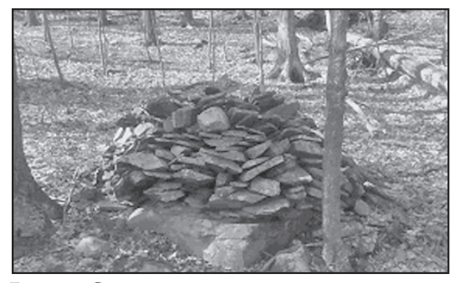
FIGURE 5. CAIRN #1.