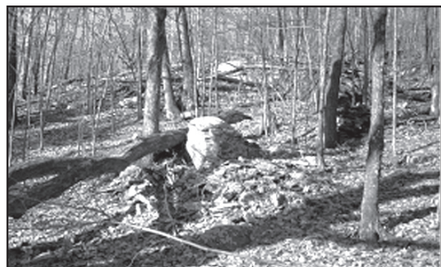
FIGURE 6. CAIRN #2.

while others appear aligned in rows. Several larger cairns are present that are considerable in size, ranging up to 100 feet in length. Many of the constructions are well organized and appear assembled with thought and purpose. Many exhibit quartzite or river stone featured prominently on their surface structure. All are located relatively near a water course and configured along ledges and slopes facing south/southeast. Additional characteristics of the large cairns include: