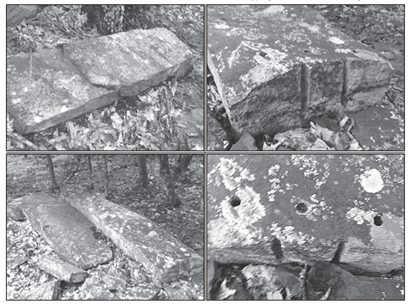
Figure 2. Working bluestone (clockwise from upper left): unworked stone, drill marks after cut, close-up of drill holes and marks, worked bluestone.

Quarrying was a tricky business that quarrymen had to know well. The bluestone was beneath layers of soil, clay, and stone. This overlay material had to be stripped. After stripping down to the block of good stone, the