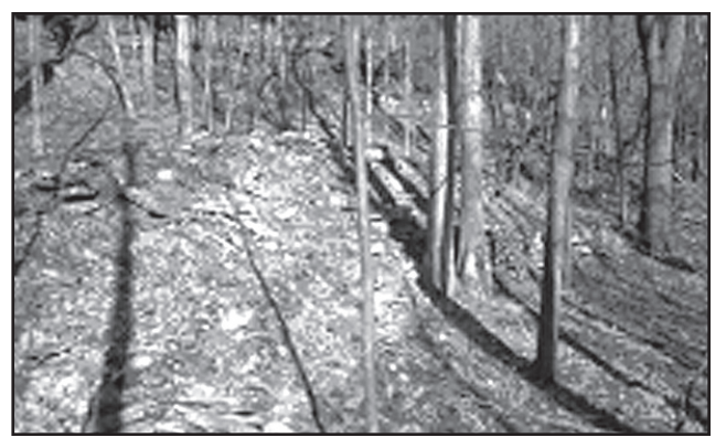
FIGURE 7. GREAT CAIRN #3.

There is a second similar sized and shaped mound located on the ledge just below the first. The upper large cairn has a row of smaller cairns (maybe nine or 10) extending off to the west.