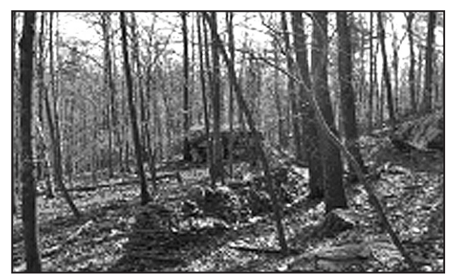
FIGURE 8. SNAKE EFFIGY.

"The Hudson Valley is widely known as an area rich in folklore and legend. Woodstock, which is both of the valley and the mountains, seems to have